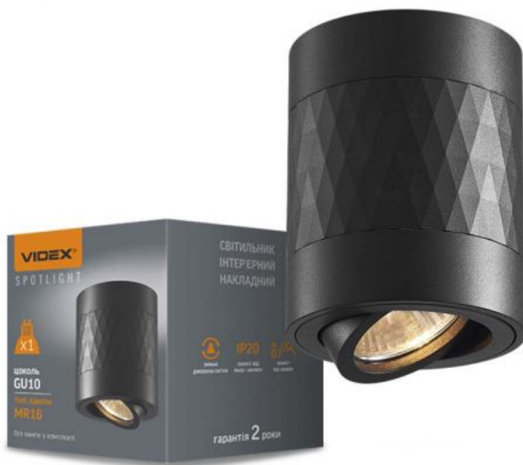
Ceiling spotlight luminaire